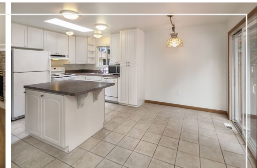
2 BEDROOM APARTMENT