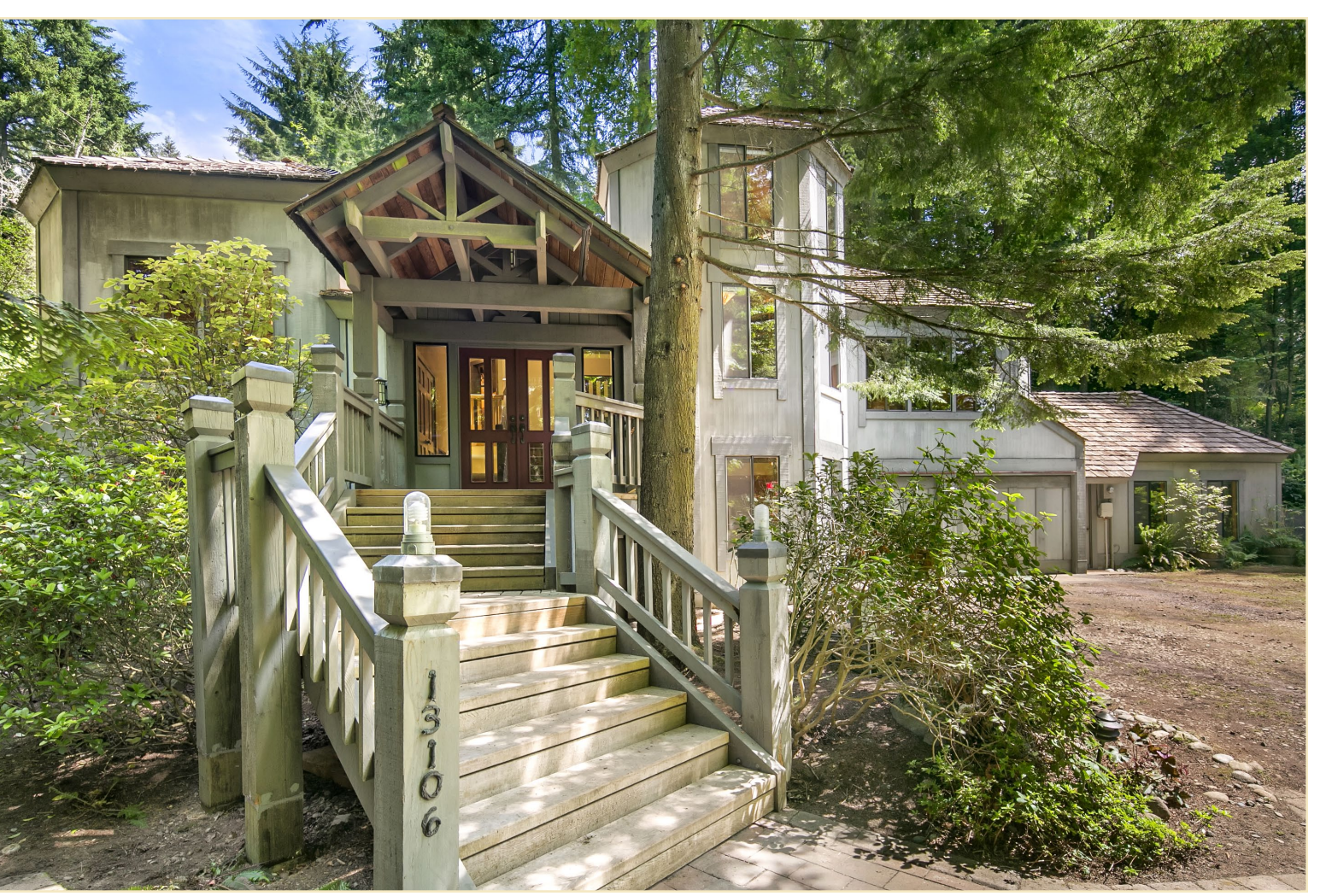
13106 NE 38th Pl, Bellevue Bridle Trails